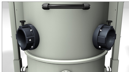
Suction inlet 01