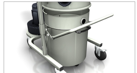
Collection tank 02