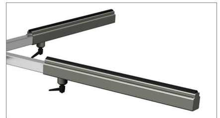
Anti-slip PVC contact surface 02